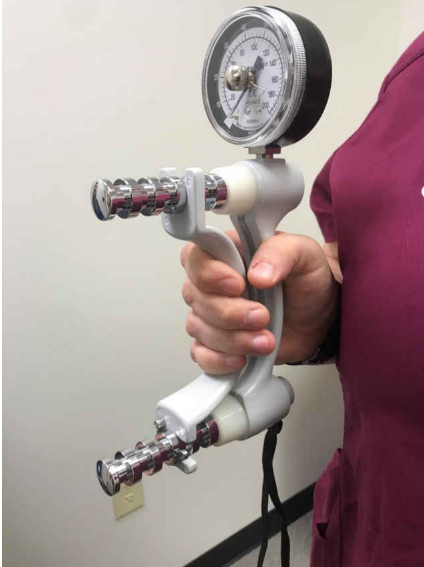
Figure 2: Hand Grip Strength Evaluation